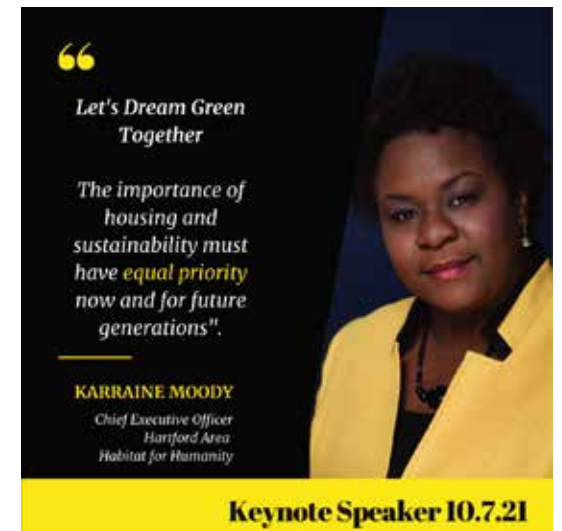
Keynote Speaker 10.7.21

We are proud to report that we are fulfilling our promise that all new construction builds will be Zero Energy Ready Home Certified, and continuing to explore other sustainable construction models. This past year, we partnered with National Ready Mix Concrete Association (NRMCA) to build another concrete home. NRMCA, in coordination with Habitat for Humanity, donated insulated concrete forms, concrete and more to support this initiative throughout the country. We will dedicate our new Zero Energy homes in 2022, and hope you will join us to celebrate affordability and sustainable construction.