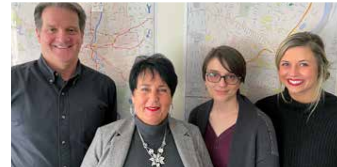
Administration and Volunteer Center 75 Charter Oak Avenue Bldg 2 Ste 205 Hartford, CT 06106 860-541-2208