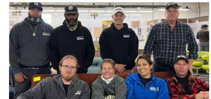
Financial Freedom Center 780 Windsor Street Hartford, CT 06120 860-541-2210