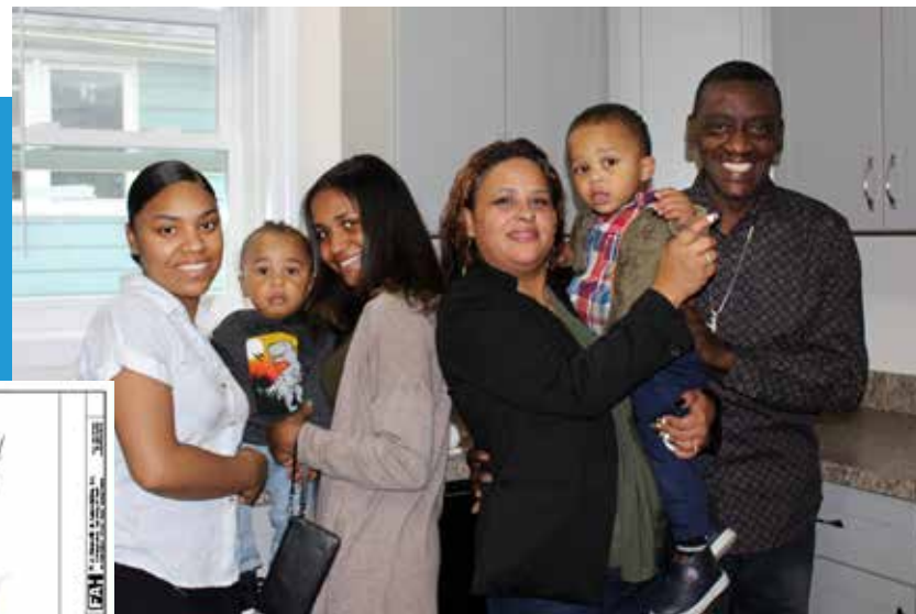
Ortiz Family at their home dedication in October 2021