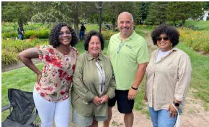
Worthington Wine Event