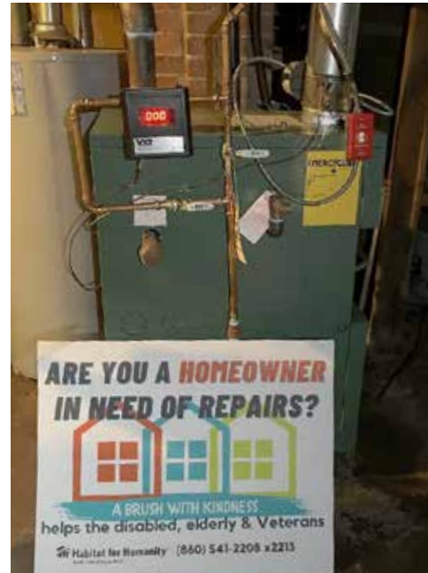
A Brush with Kindness

Being out in the community was and will continue to be a focus entering 2024. Our Habitat team was out touching nearly every corner of the region with information gatherings at places like Worthington Winery in Somers, Stafford Speedway in Stafford Springs, the 5A Baker Charity Horse Show in Ellington, and of course Playhouse builds scatter throughout the entire county.