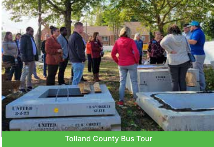
Tolland County Bus Tour

2023 was a year of deepening relationships and exploring partnership possibilities in Tolland County. Our goal as we enter 2024 is to tell as many residents, organizations, businesses and communities of faith about HFNNCC and the power of partnership in making their communities stronger, together. Although the landscape of Tolland County might be different than the cityscape of Hartford, the need for affordable housing is the same. Our goal in 2024 is to